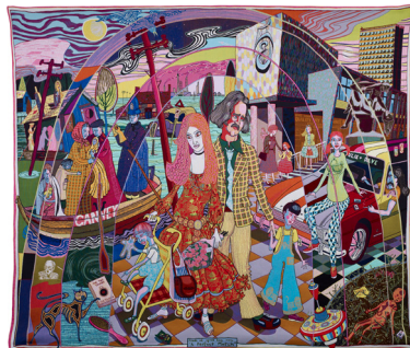
A Perfect Match , 2015 Tapestry 290 x 343 cm 114 1/8 x 135 1/8 in Edition of 9 plus 3 artist's proofs