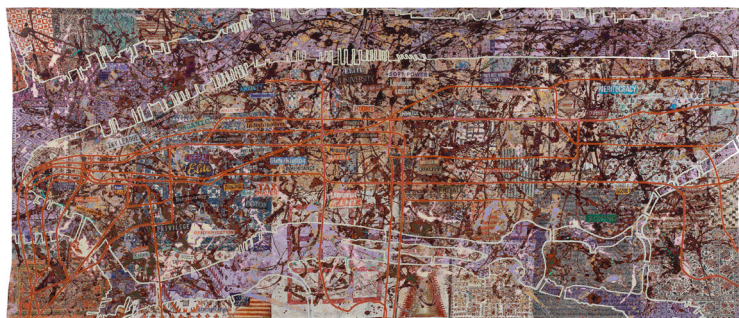
Very Large Very Expensive Abstract Painting , 2020 Tapestry 292 x 688 cm 115 x 270 7/8 in Edition of 10 plus 2 artist's proofs