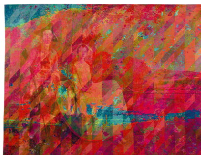
Morris, Gainsborough, Turner, Riley , 2021 Tapestry 274 x 360 cm 107 7/8 x 141 3/4 in Edition of 10 plus 3 artist's proofs