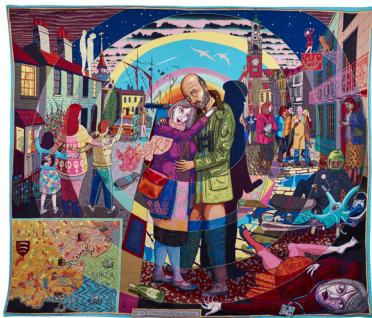
In its Familiarity, Golden , 2015 Tapestry 290 x 343 cm 114 1/8 x 135 1/8 in Edition of 9 plus 3 artist's proofs