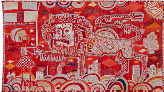
Sacred Tribal Artefact , 2023 Tapestry 200 x 350 cm 78 3/4 x 137 3/4 in Edition of 9 plus 3 artist's proofs