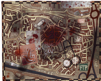
The Dignoor Tapestry , 2016 Tapestry 215 x 265 cm 84 5/8 x 104 3/8 in Edition of 6 plus 2 artist's proofs