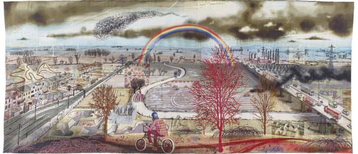
Battle of Britain , 2017 Tapestry 293 x 675 cm 115 3/8 x 265 3/4 in Edition of 10 plus 2 artist's proofs