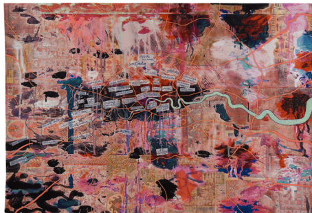
Large Expensive Abstract Painting , 2019 Tapestry 200 x 300 cm 78 3/4 x 118 1/8 in Edition of 12 plus 3 artist's proofs