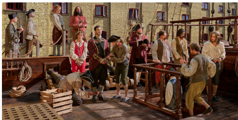
Overture: In which Convicted Brigand Captain Macheath is Transported to the West Indies Where He will be Impressed into Indentured Labour , 2024

Inkjet print mounted on Dibond aluminium