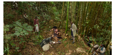
Act III, Scene VII: In which the pirate Morano (aka Captain Macheath) challenges, and is vanquished by, the Maroon Queen Pohotohee , 2024

Inkjet print mounted on Dibond aluminium