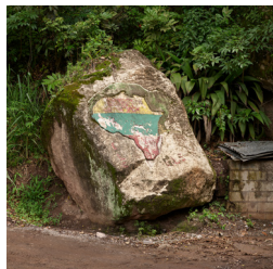
Africa Rock , 2024