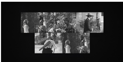
Birth of a Nation , 2025