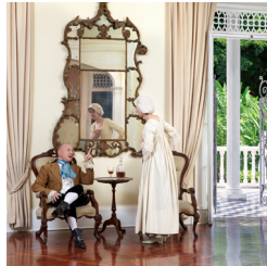
Act I, Scene XI: In which Polly Comes to Understand that Mrs. Trapes has Sold Her to Mr. Ducat as a Courtesan , 2024