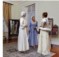
Act I, Scene XIV: In which Polly, with the Help of Damaris, Convinces Mrs. Ducat to Punish Her Husband by Granting Her Her Freedom , 2024

Inkjet print mounted on Dibond aluminium