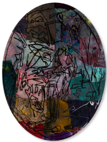
Those Memories , 2024 Acrylic, vinylic emulsion and dye-transfer print on canvas 180 x 135 cm 70 7/8 x 53 1/8 in