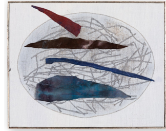
Chances Meet The Comets, 2024 Mixed media on linen 25 x 31 cm 9 7/8 x 12 1/4 in