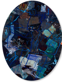
Newport Classic , 2024 Acrylic, vinylic emulsion and dye-transfer print on canvas 370 x 278 cm 145 5/8 x 109 1/2 in