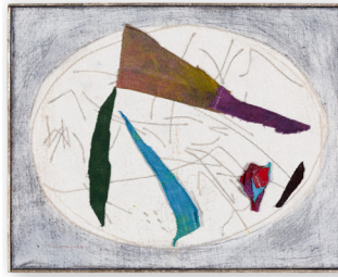
Chances Meet The Corners, 2024 Mixed media on linen 25 x 31 cm 9 7/8 x 12 1/4 in