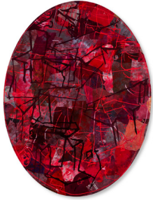
Spithere Crab , 2024 Acrylic, vinylic emulsion and dye-transfer print on canvas 370 x 278 cm 145 5/8 x 109 1/2 in