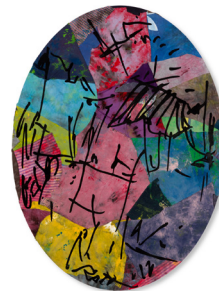
Toulouse-Lautrec , 2024 Acrylic, vinylic emulsion and dye-transfer print on canvas 180 x 135 cm 70 7/8 x 53 1/8 in