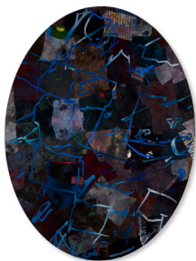
Negu Gorriak , 2024 Acrylic, vinylic emulsion and dye-transfer print on canvas 300 x 225 cm 118 1/8 x 88 5/8 in