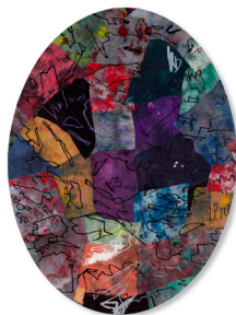
Tomorrow Will Be Too Long , 2024 Acrylic, vinylic emulsion and dye-transfer print on canvas 240 x 180 cm 94 1/2 x 70 7/8 in