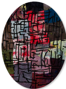
Mouse Fashion , 2024 Acrylic, vinylic emulsion and dye-transfer print on canvas 180 x 135 cm 70 7/8 x 53 1/8 in