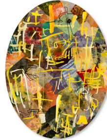
Myrtle Beach , 2024 Acrylic, vinylic emulsion and dye-transfer print on canvas 370 x 278 cm 145 5/8 x 109 1/2 in