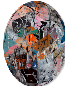
Painting by Numbers , 2024 Acrylic, vinylic emulsion and dye-transfer print on canvas 240 x 180 cm 94 1/2 x 70 7/8 in