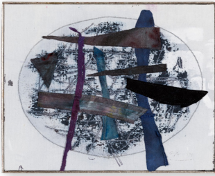
Chances Meet The Dreams, 2024 Mixed media on linen 25 x 31 cm 9 7/8 x 12 1/4 in