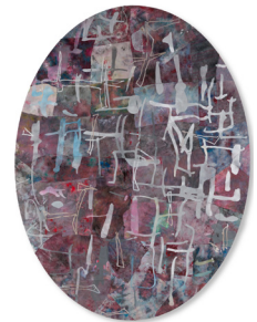
Truly Cayman , 2024 Acrylic, vinylic emulsion and dye-transfer print on canvas 300 x 225 cm 118 1/8 x 88 5/8 in