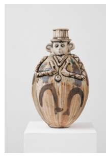
Mr Chonky Chonk, 2021