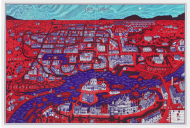
Our Town, 2022 Colour Etching Sheet size: 109.5 x 161 cm 43 1/8 x 63 3/8 in Edition of 68 plus 12 artist's proofs (#58/68)