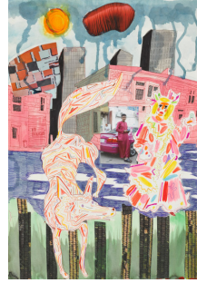
Urban Fox 2, 2021 Crayon, watercolour, collage, ink 59 x 41.7 cm 23 1/4 x 16 3/8 in