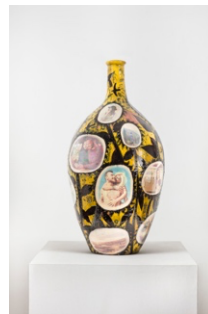
Searching for Authenticity, 2018

Edition of 10 plus 1 artist's proof (#1/10)