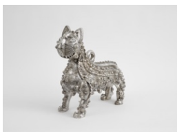
Chris Whitty's Cat, 2020