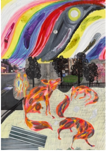
Urban Fox 3, 2021 Crayon, watercolour, collage, ink, silver foil 59 x 42.1 cm 23 1/4 x 16 5/8 in