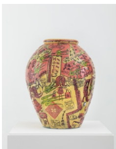
Luxury Brands for Social Justice, 2017