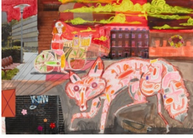
Urban Fox 1, 2021 Crayon, watercolour, collage, ink, plastic jewels 41.7 x 59 cm 16 3/8 x 23 1/4 in