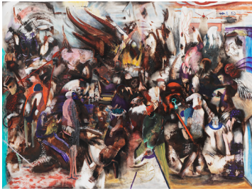
Is time an arrow or a wheel? , 2023 Oil on linen 167.6 x 223.5 cm 66 x 88 in