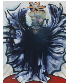
Rebis , 2023 Oil on linen 50.8 x 40.6 cm 20 x 16 in