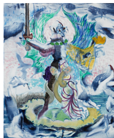
Rebis 2 , 2023 Oil on linen 43.2 x 35.6 cm 17 x 14 in