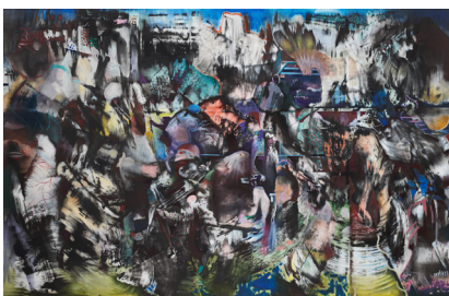
Cornerstone , 2023 Oil on linen 215.9 x 335.3 cm 85 x 132 in