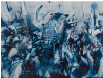
Lapis , 2021 Oil on linen 45.7 x 61 cm 18 x 24 in