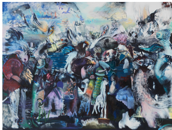
Numinous , 2023 Oil on linen 167.6 x 223.5 cm 66 x 88 in