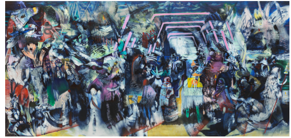
These fragments I have shored against my ruins , 2023 Oil on linen 218.4 x 457.2 cm 86 x 180 in