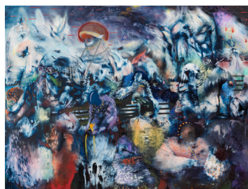
The Changing Past , 2021 Oil on linen 182.9 x 243.8 cm 72 x 96 in