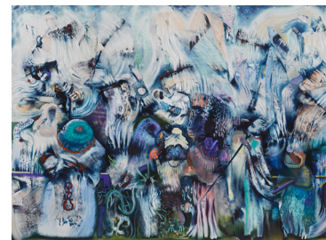
Queen of the Night , 2022 Oil on linen 208.3 x 304.8 cm 82 x 120 in