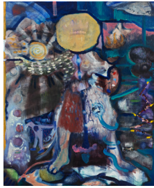
Rebis 1 , 2023 Oil on linen 43.2 x 35.6 cm 17 x 14 in