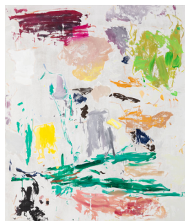
Spread so thin , 2022 Acrylic and chalk on linen 240 x 200 cm 94 1/2 x 78 3/4 in