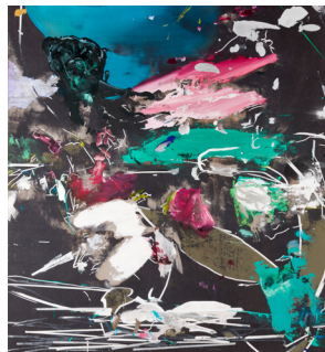
Castillal , 2022 Dye, acrylic, alkyd and oil on linen 309 x 284 cm 121 5/8 x 111 3/4 in