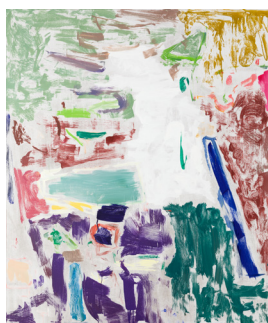
Barrera , 2022 Acrylic and chalk on linen 240 x 200 cm 94 1/2 x 78 3/4 in