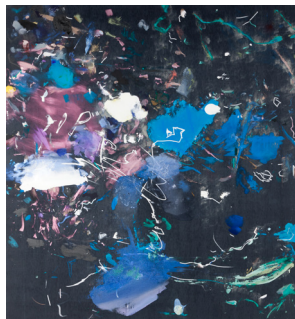
Taliar , 2022 Dye, acrylic, alkyd and oil on linen 309 x 284 cm 121 5/8 x 111 3/4 in