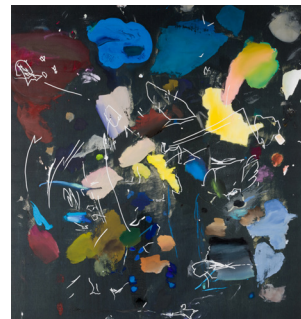
Crimosa , 2022 Dye, acrylic, alkyd and oil on linen 309 x 284 cm 121 5/8 x 111 3/4 in