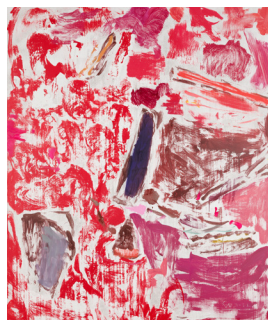
Heart shaped (rojo) , 2022 Acrylic and chalk on linen 240 x 200 cm 94 1/2 x 78 3/4 in