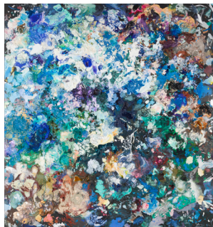
Minimar , 2022 Acrylic, alkyd and oil on linen 286 x 266 cm 112 5/8 x 104 3/4 in