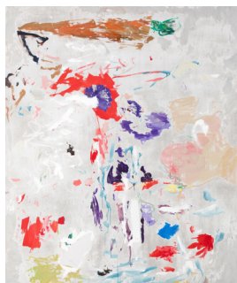
Carrot painting , 2022 Acrylic and chalk on linen 240 x 200 cm 94 1/2 x 78 3/4 in