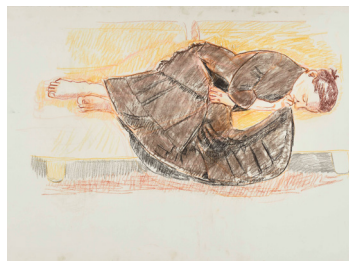
Depression No. 2 , 2007 Pastel on paper 68.5 x 101 cm 27 x 39 3/4 in