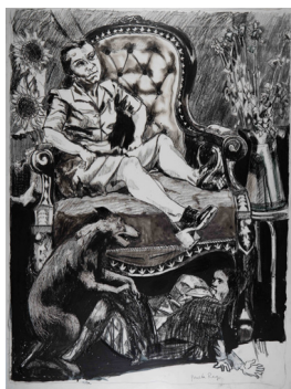
Girl on a Large Armchair , 2000 Wax crayon and watercolour on mylar 80 x 58 cm 31 1/2 x 22 7/8 in