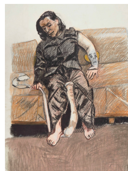
Depression No. 8 , 2007 Pastel on paper 101.5 x 68.5 cm 40 x 27 in