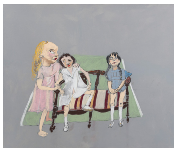
Sophia's Friends , 2017 Pastel on paper on aluminium 110 x 130.2 cm 43 1/4 x 51 1/4 in