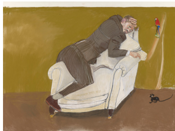
Grief , 2015 Pastel on paper on aluminium 119.2 x 160.2 cm 46 7/8 x 63 1/8 in