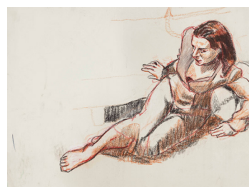
Depression No. 10 , 2007 Pastel on paper 64.5 x 80 cm 25 3/8 x 31 1/2 in