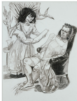
She Doesn't Want It , 2007 Graphite and conté pencil on paper 137 x 102 cm 54 x 40 1/8 in