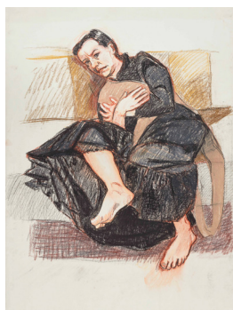
Depression No. 5 , 2007 Pastel on paper 101.5 x 68.5 cm 40 x 27 in