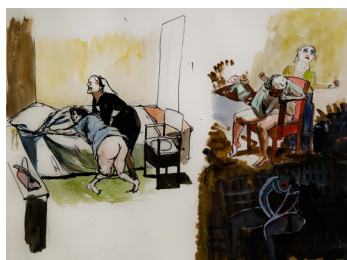
Misericordia VI , 2001 Pen, ink and watercolour on paper 41.9 x 59.4 cm 16 1/2 x 23 3/8 in