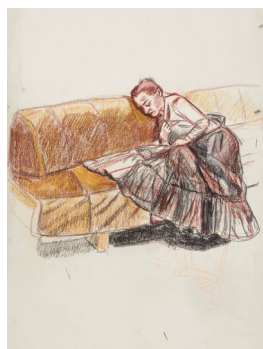
Depression No. 6 , 2007 Pastel on paper 101.5 x 67 cm 40 x 26 3/8 in