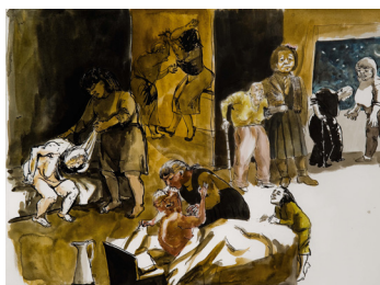
Misericordia VII , 2001 Pen, ink and watercolour on paper 41.9 x 59.4 cm 16 1/2 x 23 3/8 in