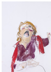
Self Portrait III , 2017 Pastel on paper 59 x 42 cm 23 1/4 x 16 1/2 in