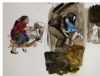
Misericordia V , 2001 Pen, ink and watercolour on paper 41.9 x 59.4 cm 16 1/2 x 23 3/8 in