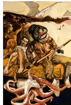
The Fisherman , 2005 Pastel on paper on aluminium 180 x 120 cm 70 7/8 x 47 1/4 in