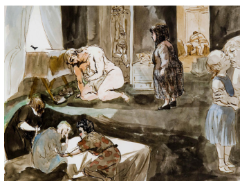
Misericordia III , 2001 Pen, ink and watercolour on paper 41.9 x 59.4 cm 16 1/2 x 23 3/8 in