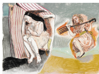
Revenge , 2011 Pastel on paper on aluminium 101 x 136.5 cm 39 3/4 x 53 3/4 in