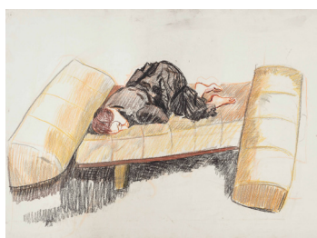
Depression No. 9 , 2007 Pastel on paper 68.5 x 101.5 cm 27 x 40 in