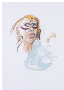
Self Portrait II , 2017 Pastel on Paper 59 x 42 cm 23 1/4 x 16 1/2 in