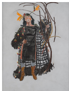
The Guardian , 2012 Pastel on paper 160 x 120 cm 63 x 47 1/4 in