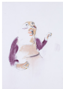
Self Portrait I , 2017 Pastel on paper 59 x 42 cm 23 1/4 x 16 1/2 in