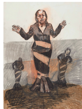
Depression No. 4 , 2007 Pastel on paper 101.5 x 68.5 cm 40 x 27 in