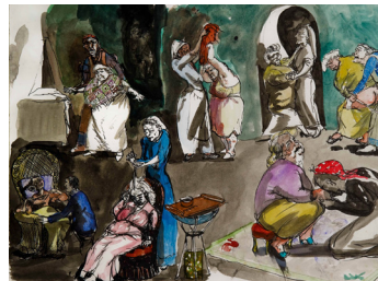
Misericordia II , 2001 Pen, ink and watercolour on paper 41.9 x 59.4 cm 16 1/2 x 23 3/8 in