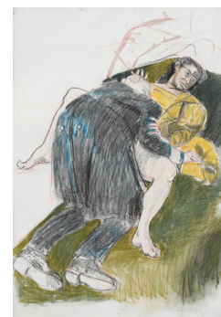
Rape , 2009 Pastel, conté and charcoal on paper 125.1 x 85.4 cm 49 1/4 x 33 5/8 in