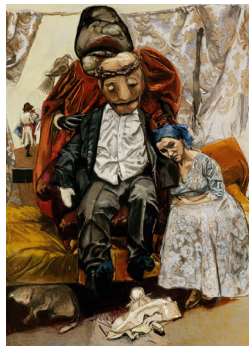
La Marafona , 2005 Pastel on paper on aluminium 187 x 135 cm 73 5/8 x 53 1/8 in