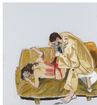
Flayed , 2012 Pastel on paper on aluminium 130.3 x 120.6 cm 51 1/4 x 47 1/2 in