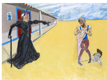
Get Out of Here You and Your Filth , 2013 Pastel on paper on aluminium 120 x 160 cm 47 1/2 x 63 in