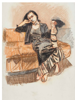
Depression No. 7 , 2007 Pastel on paper 101.5 x 68.5 cm 40 x 27 in