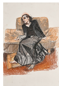
Depression No. 11 , 2007 Pastel on paper 100.5 x 68.5 cm 39 5/8 x 27 in