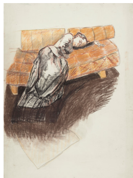
Depression No. 3 , 2007 Pastel on paper 107 x 78 cm 42 1/8 x 30 3/4 in