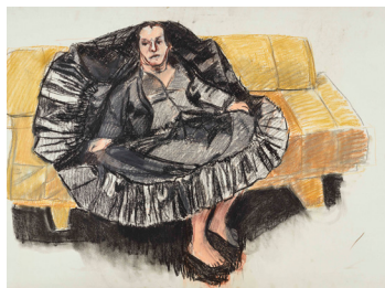
Depression No. 1 , 2007 Pastel on paper 68.6 x 101 cm 27 1/8 x 39 3/4 in