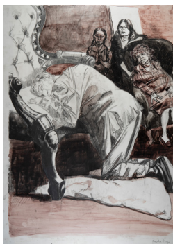
The Frotter , 2000 Wax crayons, graphite and watercolour on mylar 80.5 x 56.8 cm 33 5/8 x 22 3/8 in