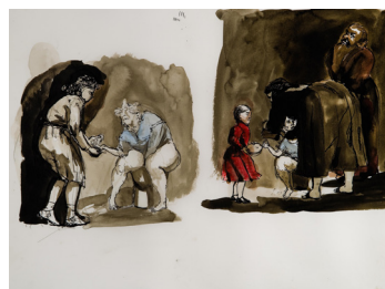
Misericordia IV , 2001 Pen, ink and watercolour on paper 41.9 x 59.4 cm 16 1/2 x 23 3/8 in