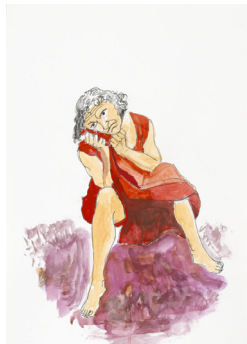
Sick of it All , 2013 Watercolour on paper 50.2 x 35.6 cm 19 3/4 x 14 1/8 in