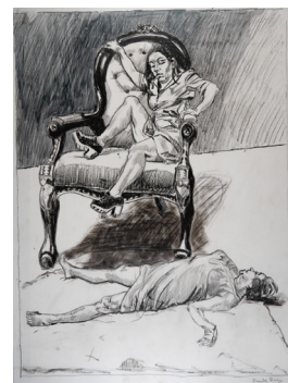
Convulsion IV , 2000 Wax crayon and watercolour on mylar 80.5 x 61 cm 31 3/4 x 24 1/8 in