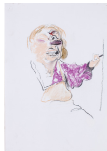
Self Portrait V , 2017 Pastel on paper 42 x 30 cm 16 1/2 x 11 3/4 in