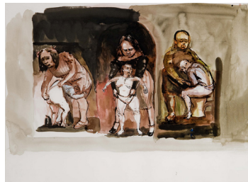
Misericordia I (Pedro Galdos) , 2001 Pen, ink and watercolour on paper 41.9 x 59.4 cm 16 1/2 x 23 3/8 in