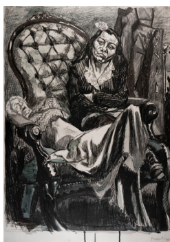
Nursing , 2000 Wax crayon and watercolour on mylar 80.5 x 60 cm 33 5/8 x 23 5/8 in