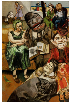
Reading the Divine Comedy by Dante , 2005 Pastel on paper on aluminium 180 x 120 cm 70 7/8 x 47 1/4 in