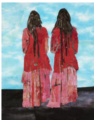
María Berrío The Oracles' Silence , 2019 Collage with Japanese paper and watercolour paint 152.4 x 121.9 cm 60 x 48 in