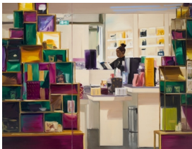
Caroline Walker The Wishlist , 2019 Oil on linen 170 x 220 cm 66 7/8 x 86 5/8 in