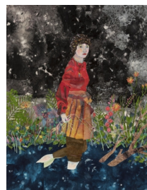
María Berrío Night Song , 2019 Collage with Japanese paper and watercolour paint 152.4 x 121.9 cm 60 x 48 in