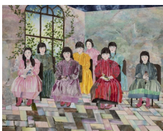
María Berrío Oda a la Esperanza (Ode to Hope) , 2019 Collage with Japanese paper and watercolour paint 233.7 x 299.8 cm 92 x 118 in