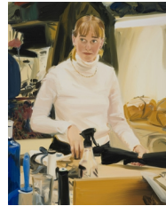
Caroline Walker Bella , 2019 Oil on linen 85.3 x 70.2 cm 33 5/8 x 27 5/8 in