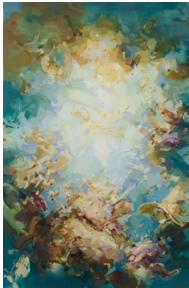
Flora Yukhnovich Out of the Strong Came Forth Sweetness , 2019 Oil on linen 258.5 x 170 cm 102 3/8 x 66 7/8 in