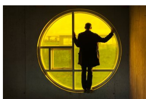
ECLIPSE (Playtime), 2013 Endura Ultra Photograph 160 x 240 cm 63 x 94 1/2 in Edition of 6 plus 1 AP