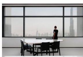
HORIZON / ELSEWHERE (Playtime), 2013 Endura Ultra Photograph 160 x 240 cm 63 x 94 1/2 in Edition of 6 plus 1 AP