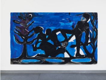
Four Idioms on Negro Art #4 Primitivism , 2015 Flashe, tempera, and watercolour on paper 196.6 x 323.5 x 9 cm 77 3/8 x 127 3/8 x 3 1/2 in