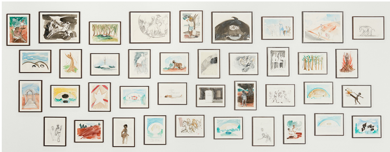
Row I ATL Notes, 2015 Eleven individual works on paper Dimensions and media variable Left – right Wave to Stranger, Incomplete Monument, Untitled (miniature house in forest), ATL... And a mule, No Bus Shelters, Stone Fountain, Funerary Mule, No Sidewalk, Donkey / Mule