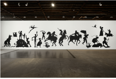
The Jubilant Martyrs of Obsolescence and Ruin, 2015 Cut paper on wall 420 x 1775 cm 165 3/8 x 698 7/8 in