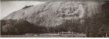
Kara Walker with Ari Marcopoulos The Stone Mountain Dr. Martin Luther King referred to in his famous "I Have a Dream" speech of 1963 (with monument to the Confederacy completed in 1972), 2015 Digital file, photographic print, certificate Dimensions variable