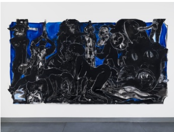
Four Idioms on Negro Art #2 Graffiti , 2015 Flashe, tempera, watercolour, and chalk on paper 196.2 x 356.6 x 9 cm 77 1/4 x 140 3/8 x 3 1/2 in