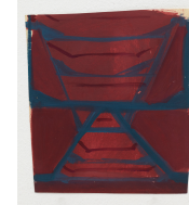
Tess Jaray Untitled, 1962 Oil paint on paper 12.1 x 11.6 cm | 4 3/4 x 4 5/8 in