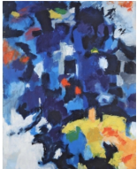
Alma Thomas Untitled, 1961 oil on canvas 101.6 x 81.3 cm 40 x 32 1/8 in