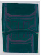
Tess Jaray Untitled [ Study 2 Towards 'Castle Green' ], 1962 Oil paint on paper 15.2 x 11.2 cm 6 x 4 3/8 in