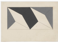
Lygia Clark Planos em Superficie Modulada , 1957 Gouache, graphite and cardboard 25 x 35 cm (9 7/8 x 13 3/4 in) Framed 57.3 x 67.6 x 3.8 cm (22 1/2 x 26 5/8 x 1 1/2 in)