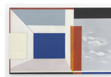
Suzanne Blank Redstone After Piero Della Francesca - The Flagellation of Christ , 1967 Acrylic on masonite 76.2 x 122 cm 30 x 48 in