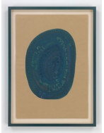
Mira Schendel Untitled, ca. 1970 Crayon and Ecoline on paper 48 x 33 cm / 18 7/8 x 13 inches 54.9 x 39.8 x 3.5 cm / 21 5/8 x 15 5/8 x 1 3/8 inches (framed)