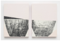
Mary Ramsden Mama Lion , 2017 Oil on panel Each panel measures: 40 x 30 x 3.5 cm 15 3/4 x 11 3/4 x 1 3/8 in