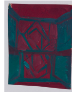
Tess Jaray Untitled, 1962 Oil paint on paper 14 x 11 cm 5 1/2 x 4 3/8 in