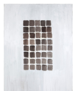
Ilse D'Hollander Untitled (306) , 1995 Oil on canvas 55 x 71 cm 21 5/8 x 28 in