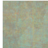
Howardena Pindell Untitled, 1971 Acrylic on canvas 165.1 x 168.3 cm 65 x 66 1/4 in