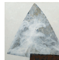
Tomie Ohtake Untitled, 1987 Acrylic on canvas 150 x 150 cm 59 1/8 x 59 1/8 in