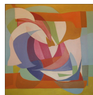
Betty Blayton Hard Edge # 3 - Intermezzo , 1969 oil on canvas 40.25 x 40.25 inch 102.235 x 102.235 cm