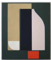
Svenja Deininger Untitled, 2018 Oil on canvas 70 x 65 cm 27 1/2 x 25 5/8 in