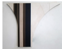
Svenja Deininger Untitled, 2018 Oil on canvas 96 x 118 cm 37 3/4 x 46 1/2 in