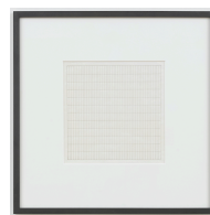
Agnès Martin Untitled, 1995 Pencil and ink on paper 27.9 x 27.9 cm 11 x 11 in