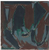
Betty Parsons End of Winter , 1958-59 Oil on canvas 95.5 x 93.66 cm 37 5/8 x 36 7/8 in