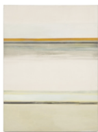
Hedda Sterne Vertical Horizontal #7 1/2 , 1963 Oil on canvas 182.9 x 137.2 cm 72 1/8 x 54 1/8 in