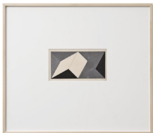
Lygia Clark Planos em Superfície Modulada , 1957 Gouache, graphite, cardboard Unframed: 25 x 35 cm - 9 7/8 x 13 3/4 ins Framed: 67.3 x 77.2 x 3.8 cm - 26 1/2 x 30 3/8 x 1 1/2 ins