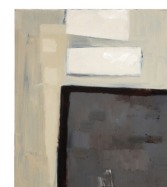
Ilse D'Hollander Untitled (292) , 1995 Oil on canvas 48 x 54 cm 18 7/8 x 21 1/4 in