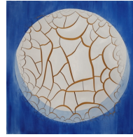
Adriana Varejão Azulejão (Moon) , 2018 Oil and plaster on canvas 180 x 180 cm 70 7/8 x 70 7/8 in