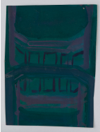
Tess Jaray Untitled [ Study Towards 'Castle Green' ], 1962 Oil paint on paper 14.5 x 10.6 cm | 5 3/4 x 4 1/8 in