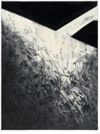
Jay DeFeo White Water , 1989 Oil on linen 41 x 30.5cm