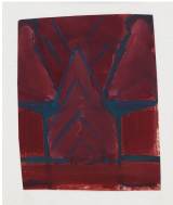
Tess Jaray Untitled, 1962 Oil paint on paper 14.6 x 11.6 cm | 5 3/4 x 4 5/8 in