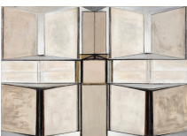
Hedda Sterne Untitled, 1982 Acrylic and pastel on canvas 113.7 x 161.9 cm 44 3/4 x 63 3/4 in