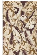
Lee Krasner The Farthest Point , 1981 Oil and paper collage on canvas 144.1 x 94.6 cm