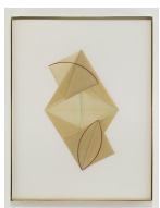
Dorothea Rockburne Parallelogram with two small squares (from Vellum Curve series) , 1978 Mixed media, vellum, pencil, glue and varnish 42 1/2 x 32 1/2 inches 108 x 82.6 cm