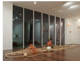
Trans, 2013 Braided straw, bricks, fiberglass, resin, beads, wheel barrow, clay, soil, ceramic and cactus 550 x 410 x 1120 cm Dimensions variable