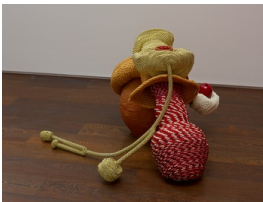
Untitled, 2013 Ropes, beads, fiberglass and resin 70 x 115 x 102 cm Dimensions variable