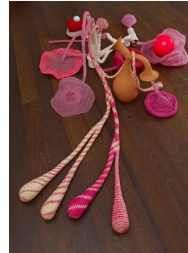
Untitled, 2013 Ropes, beads, ceramic, fiberglass, braided straw, drain pipe and resin 85 x 240 x 300 cm Dimensions variable