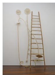
The Pearl, the Bamboo and the Straw, 2014 Bamboo ladder, pearls and braided straw 430 x 200 x 60 cm Dimensions variable