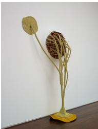
Untitled, 2014 Bricks, cement, fiberglass, beads and pastels 280 x 180 x 76 cm Dimensions variable