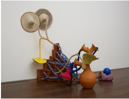
Untitled, 2013 Ropes, beads, ceramic, bricks, fiberglass and resin 125 x 120 x 180 cm Dimensions variable