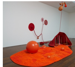
Grande Boca, 2013 Ropes, beads, fiberglass, resin, plates, wooden paint brushes and acrylic and ceramic 600 x 500 x 720 cm Dimensions variable