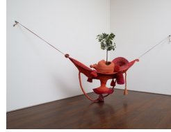
Redemagma, 2013 Ropes, beads, fiberglass, resin, hooks, soil and Orange tree 255 x 80 x 590 cm Dimensions variable