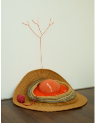
Untitled, 2013 Beads, ropes, ceramic, fiberglass and resin 175 x 165 x 120 cm Dimensions variable