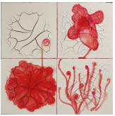
Adriana Varejão Drosera aliciae, filiformis e Sarracenia purpurea , 2012 oil and plaster on canvas Four panels 99 x 99 cm each 39 x 39 in each (ADV 1359)