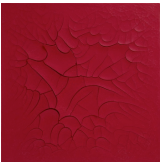
Adriana Varejão Vermelho Carnívoro [Carnivorous Red] , 2014 oil and plaster on canvas 99 x 99 cm 39 x 39 in (ADV 1360)